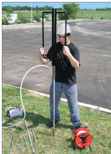
Installing Piezometers with a Manual Slide Hammer

Solinst Drive-Point Piezometers can be driven into the ground with any direct push or drilling technology, including the Manual Slide Hammer shown at right. To avoid clogging or smearing of the screen during installation, a shielded version is also available.