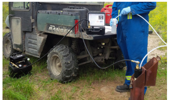
Sampling with a Dedicated Bladder Pump using Portable, Rugged, Easy-to-use, Compressor and Controller

For water level monitoring there is an access hole to fit a Solinst Model 101 Water Level Meter or Levelogger. An eyebolt is provided for a pump support cable or for suspension of a Solinst Levelogger, (see Model 3001 Data Sheet) or other device.