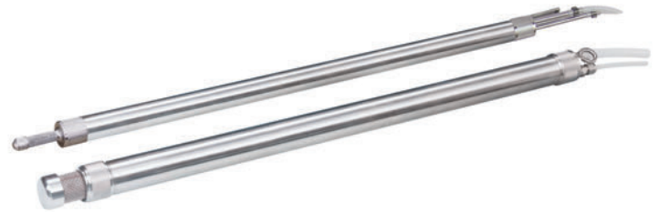
Solinst Bladder Pumps available in Stainless Steel 1" and 1.66" (25 mm and 42 mm).