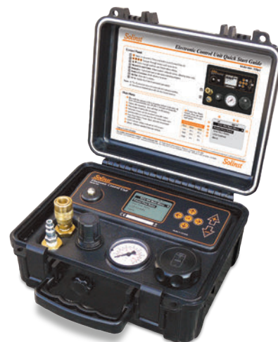
Model 464 Electronic Control Unit (125 psi and 250 psi Models)

These convenient Controllers are rugged, dependable and suitable for all environments. Quick-connect fittings allow instant attachment to dedicated well caps, portable reel units and to an air compressor or compressed gas source.