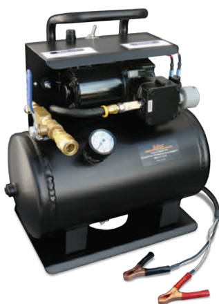
12 Volt Compressor

The compressor operates using 12 volt DC power source, such as a car or truck vehicle battery, and comes with alligator clips. The compressor operates at up to 125 psi and is equipped with a 2 US gallon (7.6 L) air tank which is rated to 150 psi.