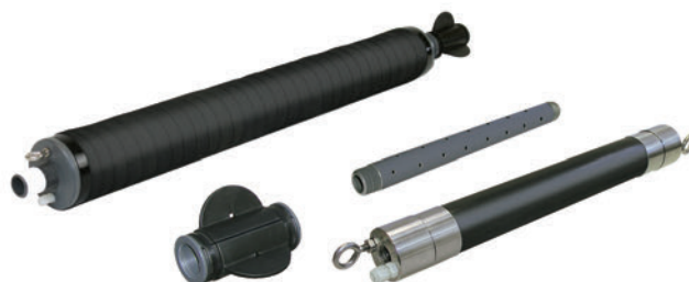
Model 800 Packers 3.9" and 1.8" (99 mm and 46 mm)

Model 800 Low-Pressure Packers can be used with Solinst Bladder Pumps to minimize purge times by reducing purge volumes. This reduces the cost of water disposal and labour. Packers are available in single point or straddle packer designs, and in sizes to fit 2" (50 mm) to 5" (127 mm) dia. wells. (See Model 800 Data Sheet.)