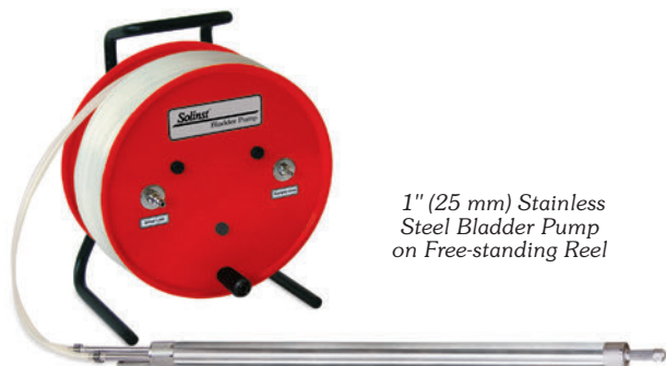
1" (25 mm) Stainless Steel Bladder Pump on Free-standing Reel

They are supplied on a free-standing reel. The rugged systems are very convenient and easy to transport. Tubing fittings on the reels and controller are compression fittings, allowing quick set up in the field. The Solinst Model 103 Tag Line can be used to lower and support the pump in the well (see Model 103 Data Sheet).