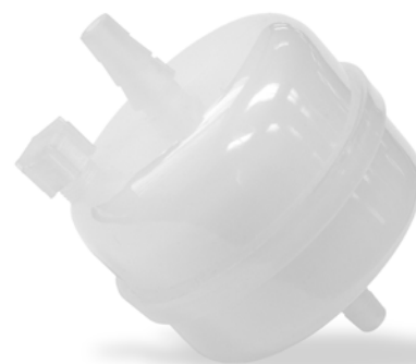
Model 860 Disposable Filter