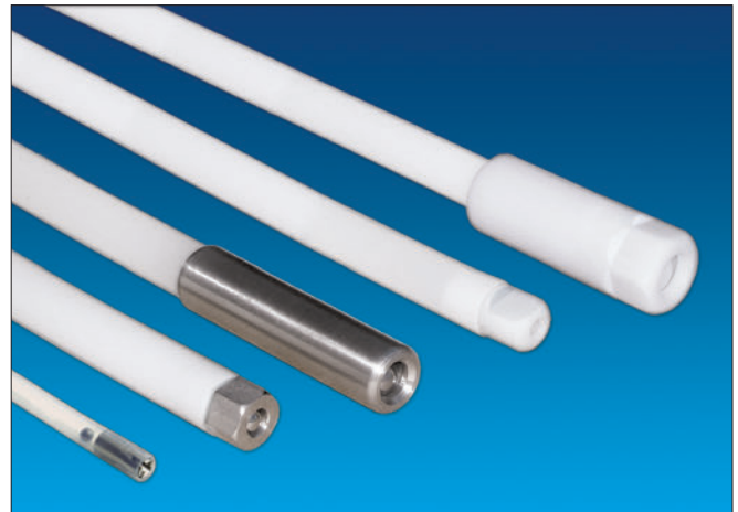
From left to right: Mini Inertial Pump, SS16, SS19, D16, and D25 Inertial Pumps