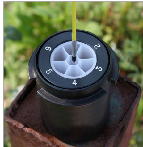
Measure water levels within the narrow channels of a Solinst CMT® System.

The 102M Mini Water Level Meter is available in 25 m and 80 ft lengths. There is the choice of the P4 or P10 Probe.