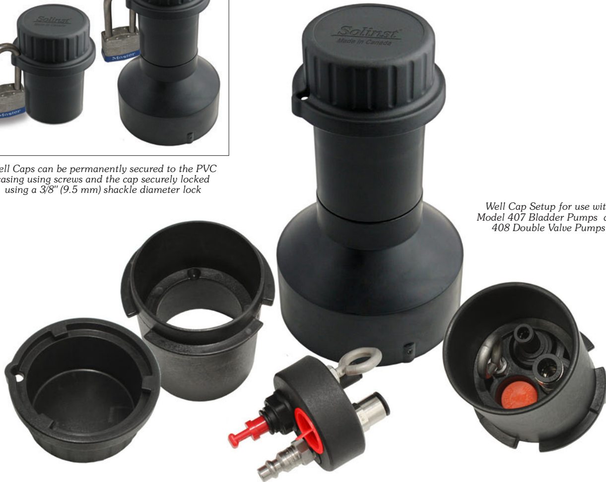
Well Cap Setup for use with Model 407 Bladder Pumps and 408 Double Valve Pumps