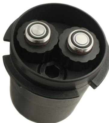
Well Cap with Two Levellogger Direct Read Cables Installed (one additional access hole available for monitoring)