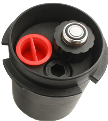
Well Cap with Single Levellogger Direct Read Cable Installed (two additional access holes available for monitoring)