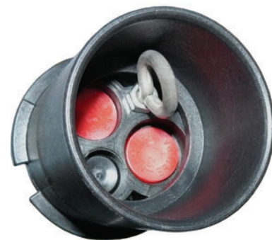
Bottom View shows eyebolt used to secure pumps and transducers