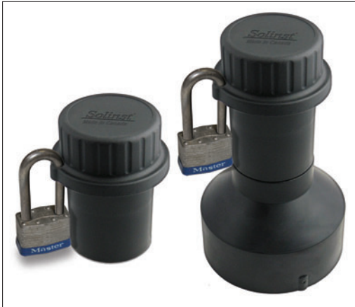
Well Caps can be permanently secured to the PVC casing using screws and the cap securely locked using a 3/8" (9.5 mm) shackle diameter lock