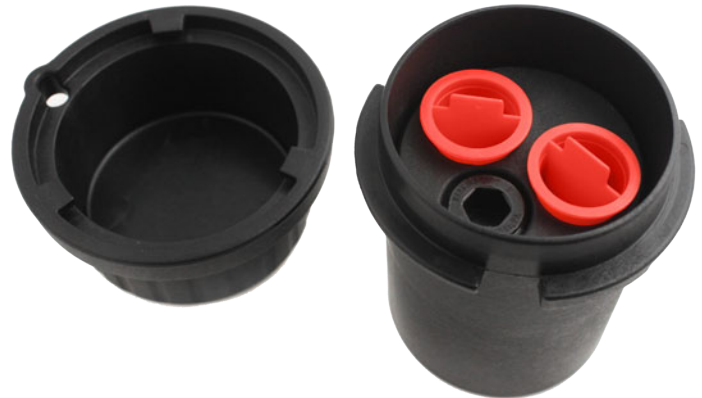
Standard 2" Locking Well Cap with dust plugs Top View

When installing Levelloggers using a Direct Read Cable, the cable simply fits inside the convenient well cap insert hole, when the red dust cap is removed. For Levellogger installations where a Barologger is to be installed in the same well, the well cap supports up to two Direct Read Cables. Even with the two Direct Read Cables installed, there is still an access hole available for manual water level measurements or groundwater sampling, without disturbing the down-hole Levelloggers.